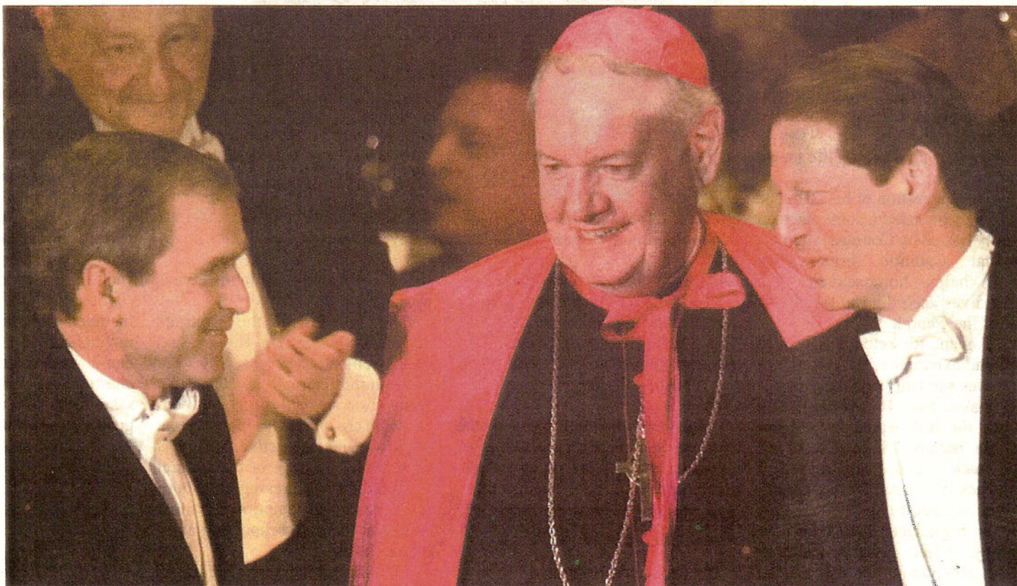
N.Y. Archbishop Edward Egan hosts presidential hopefuls Al Gore Jr. and George W. Bush at the Al Smith Dinner in New York Oct. 19. Asked about an Oct. 1 Register article, Bush told diners he was 'honored' to have the support of Democrat Ray Flynn.